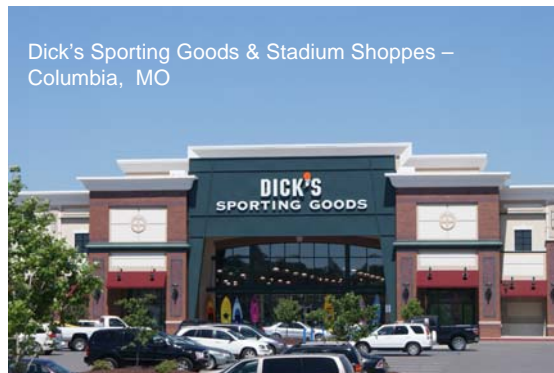
Dick's Sporting Goods & Stadium Shoppes – Columbia, MO