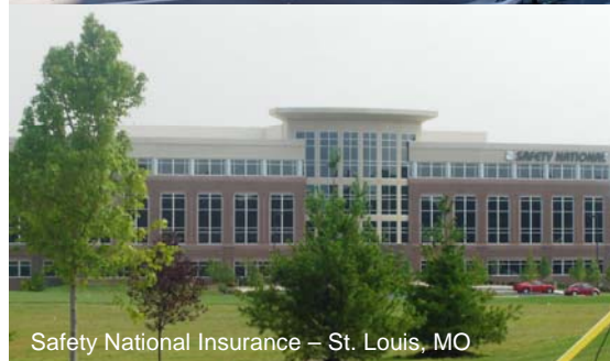
Safety National Insurance – St. Louis, MO