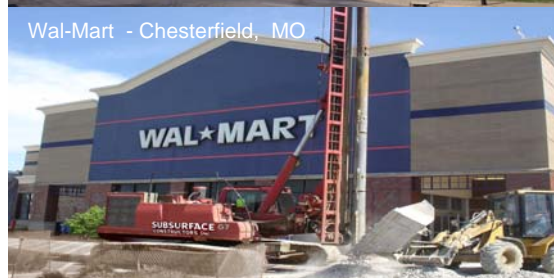
Wal-Mart - Chesterfield, MO